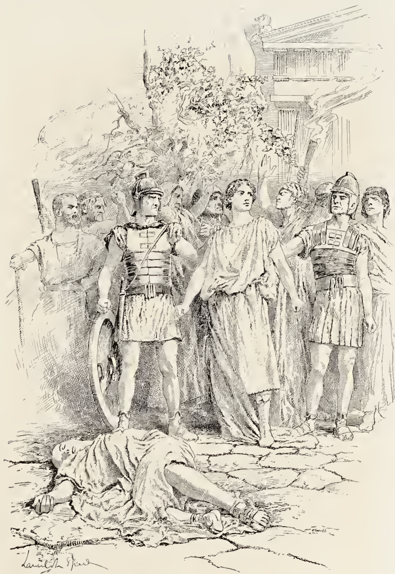
“Glaucus is accused of the murder of Apæcides.”